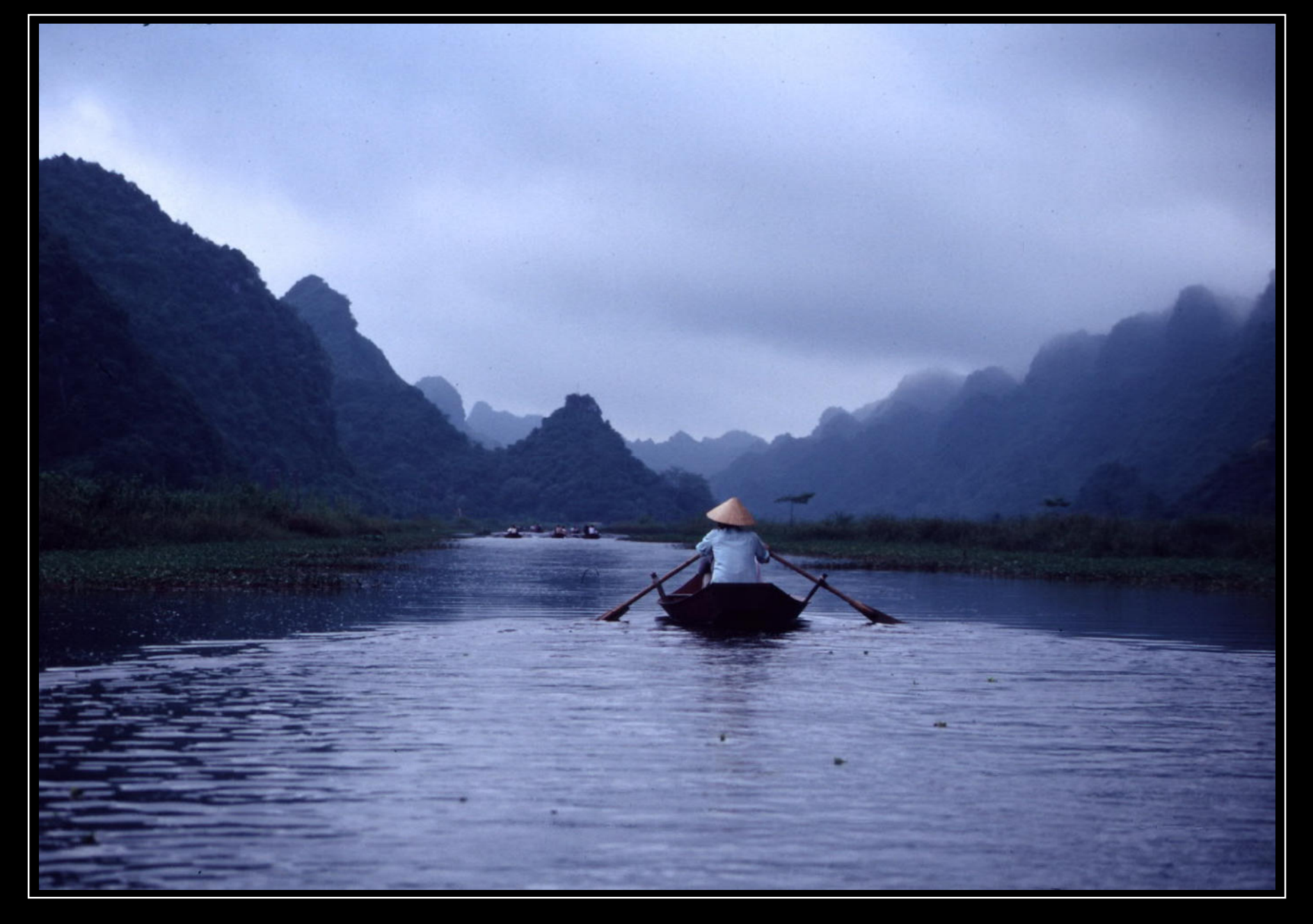
Slide confidently into the unknown - with a powerful, steady oar stroke. By boat to the Fragrance Pagoda (Chua Huong) in the limestone cliffs of the Huong Tich Mountains, ~60 km of Hanoi (Vietnam) - August 2003