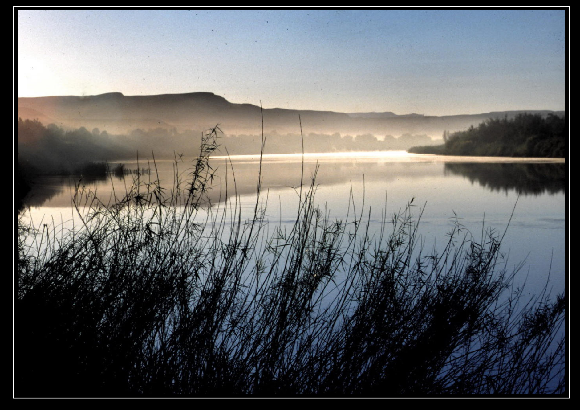
Sometimes you first have to move aside the jungle, before you can see the light. The new day is reflected in the Fish River Canyon (Namibia) – July 2000