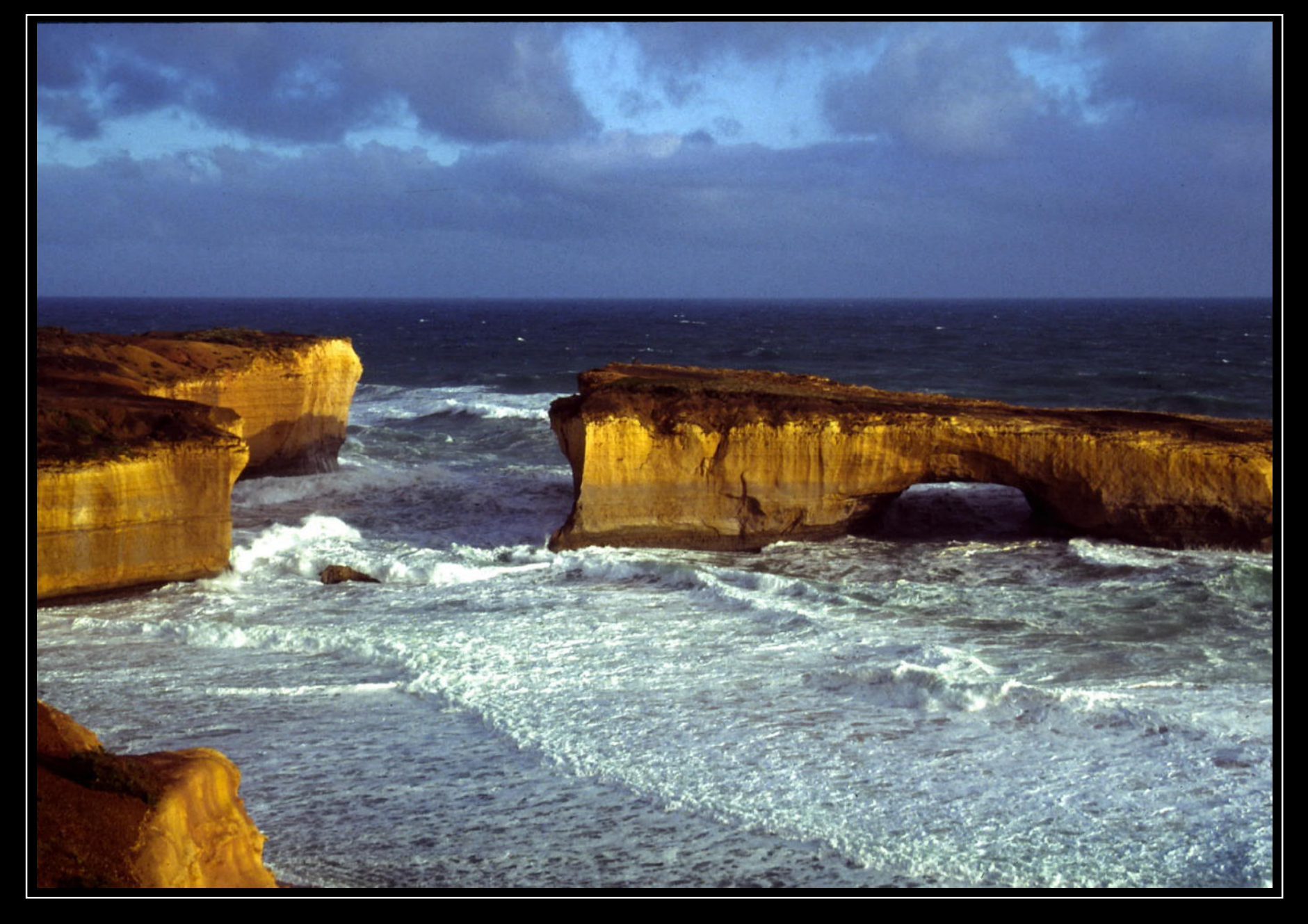
• Welcome to the play of waters, which flows, drips, spits, runs, rests, sparkles and more. The so called Tower Bridge at the Great Ocean Road (South-West of Australia) – July 1992