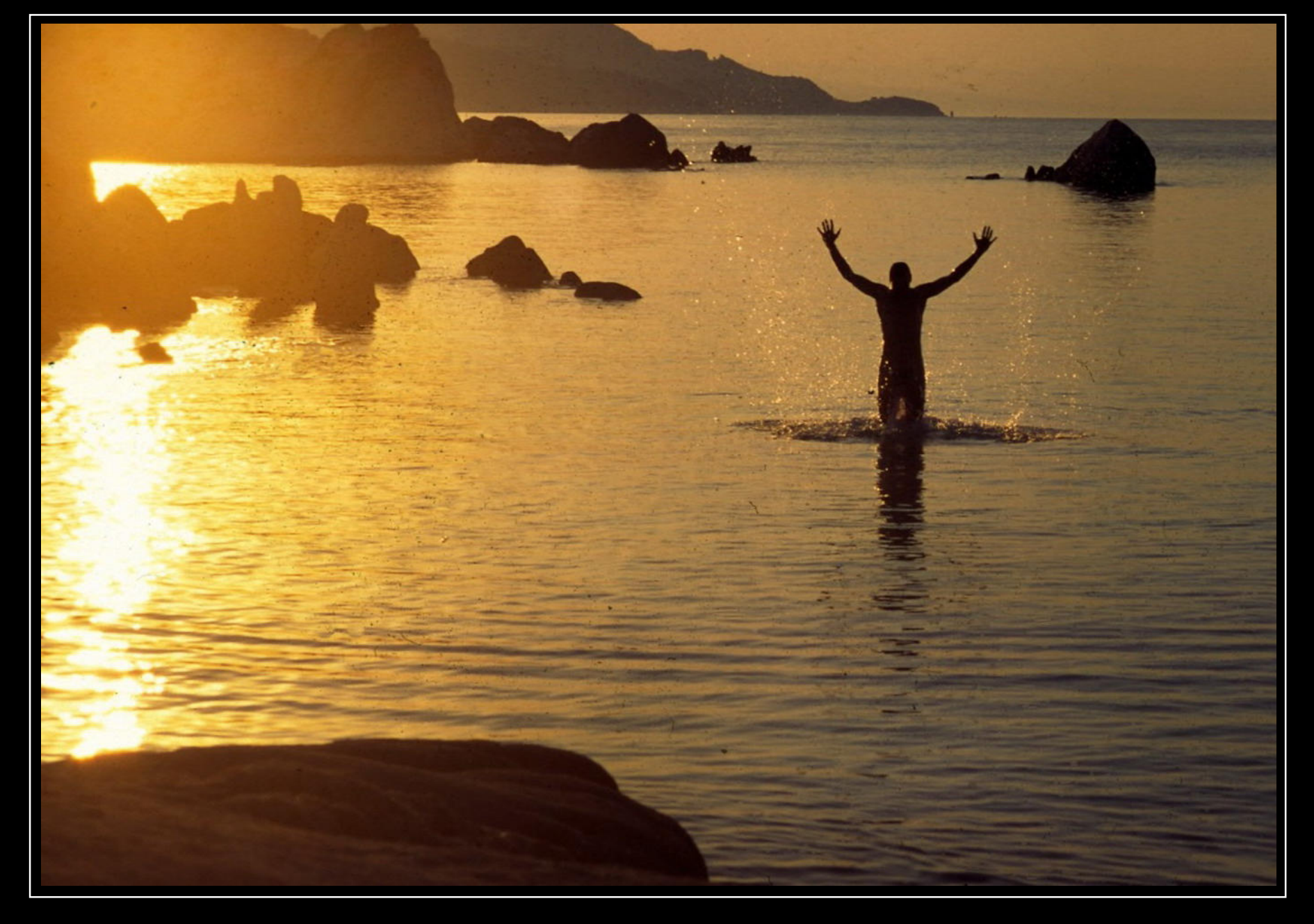
Now and then jump out of the water like a phoenix and feel your reborn powers. © The many bathing bays on the Sithonia peninsula south of Thessaloniki invite you to an evening dive (Greece) - June 1995