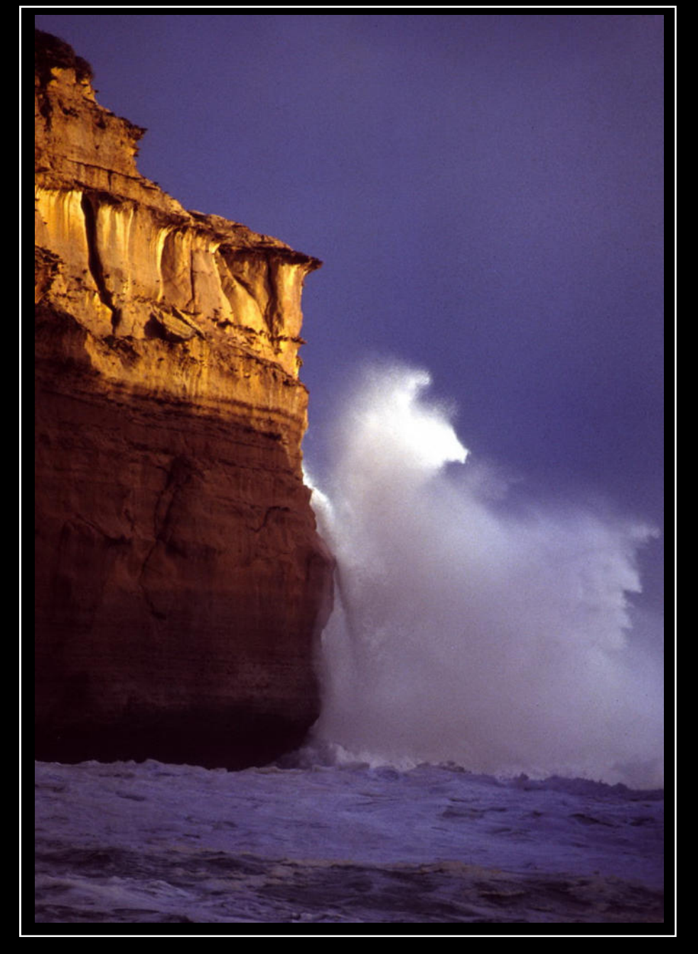
• Humans get then a special contour, if they have overcome rough situations. © Along the Great Ocean Road rock formations are exposed to the forces of wind and water (Australia) – June 1992