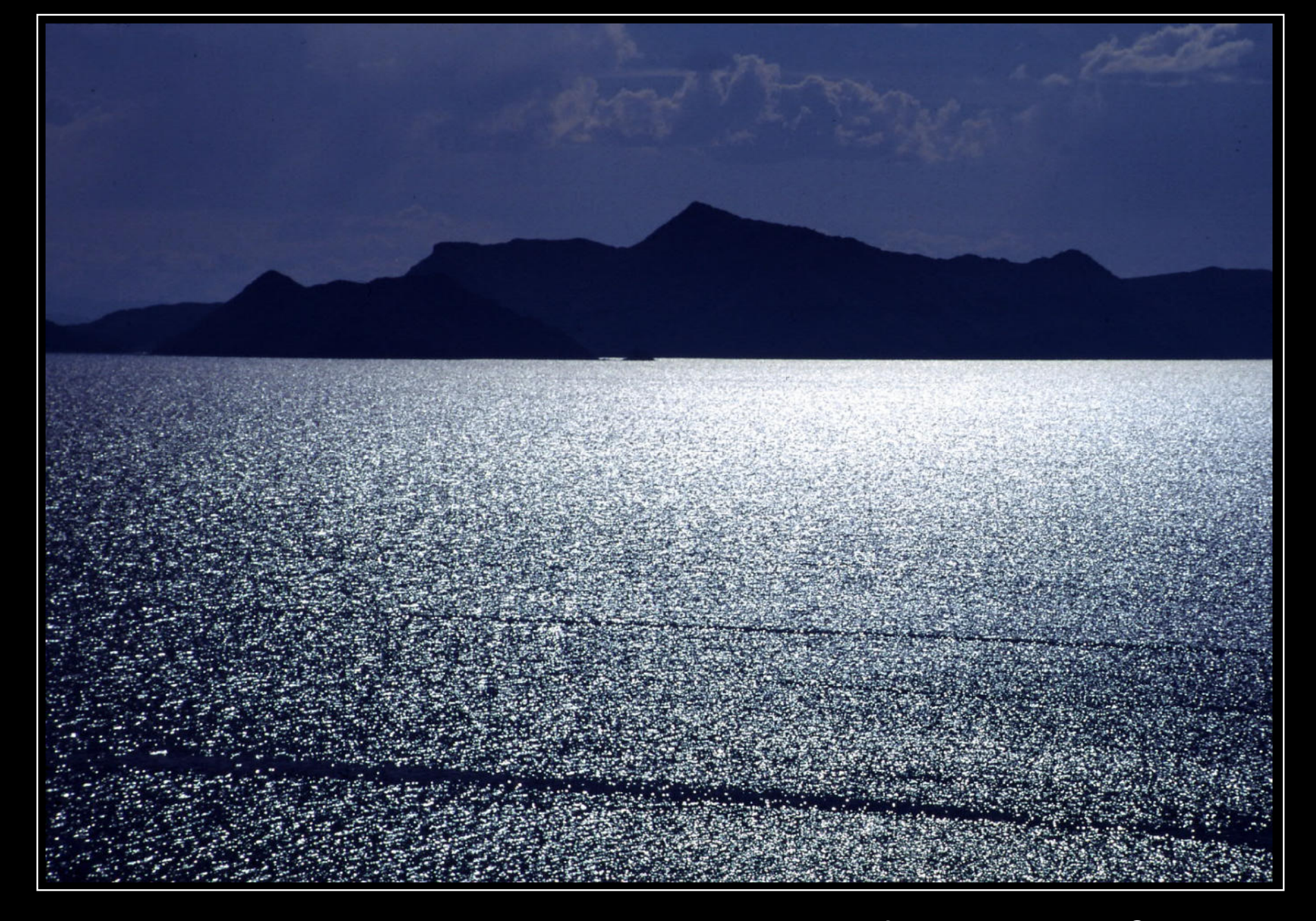
Not everything which sparkles and shines is gold, but often more precious. The Titicaca Lake (3.810 m a. SL) reflects the evening sun with a thousand times of sparkle (Bolivia) – June 1996