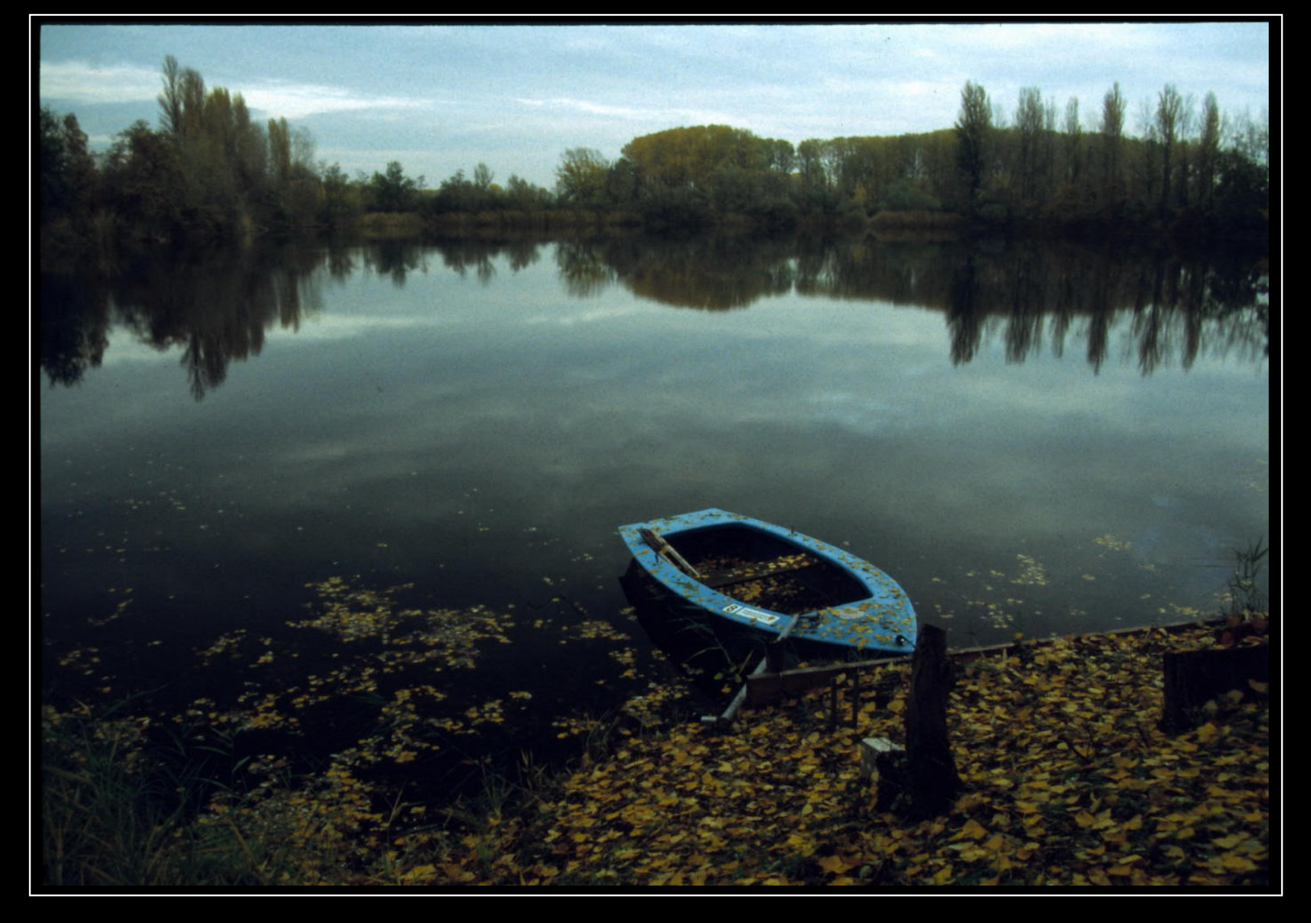
• Once a while do float like a leave on the water without having the oars in your hands. Mystic, autumnal atmosphere on the lakes of the nature reserve of Altrip near Mannheim (Germany) - October 2004