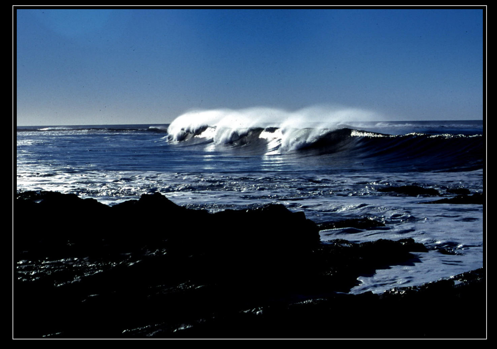
● Use the waves of life for riding on them into your future. © The Jeffreys Bay nearby Durban is not only a paradise for surfers (South Africa) – June 2007