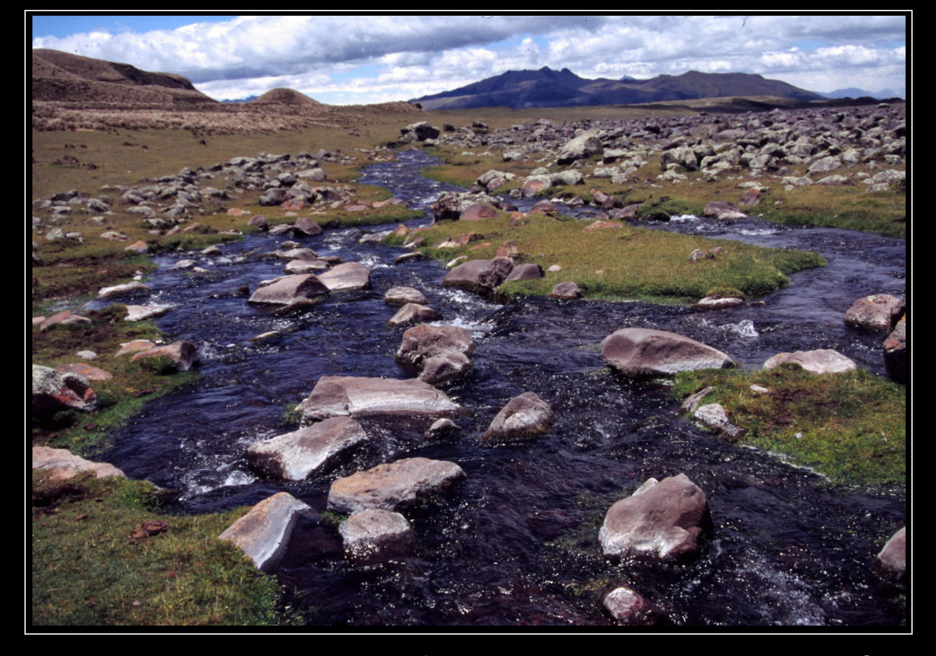
© To overcome obstacles, you can jump from stone to stone or simply walk over the water. ◎ A beautiful landscape flows around the volcano Cotopaxi (5,897 m) in the national park of the same name (Ecuador) - June 2004