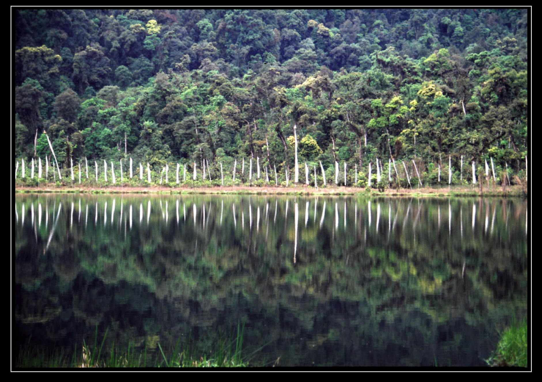
You have many facets. Learn also to love those, which mirror image you do not like so much. Prayer flags reflect in a calm lake along the Monastery Trek in Sikkim (Northern India) − July 1993