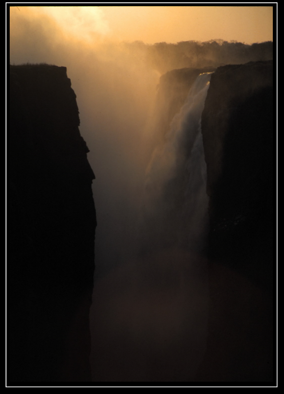
Sometimes it needs a Skyfall into the depth in order to get in touch with your forces. The Viktoria Falls plunge into the colorful spectral light of a rainbow (Simbabwe) – August 2000