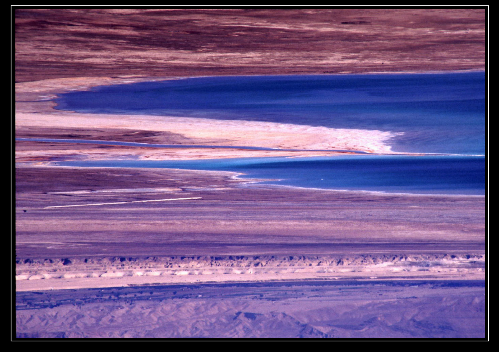
© Even in the most tried out situation you will find something precious. © The salty Dead Sea is headstrongly stranded at its own coastal line (Israel) – April 1995