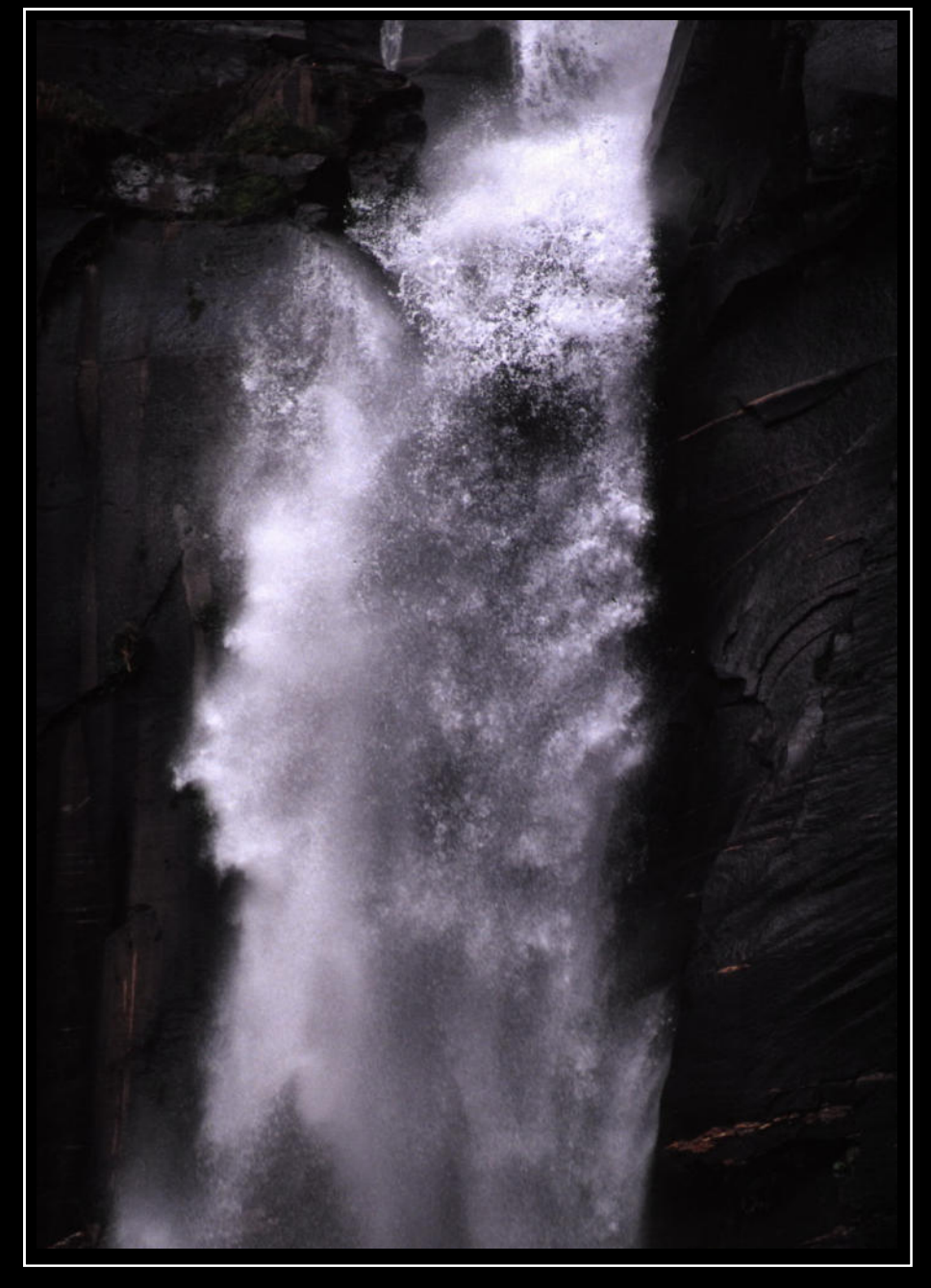
Soft is stronger than hard, water is stronger than rock and love is stronger than violence. - Hermann Hesse Bonus image: Water cascading down and across nearby Manali (2,000 m) in Northern India - June 1993